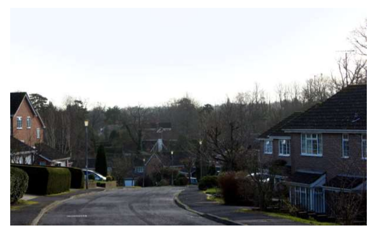
Even in winter, PWC remains well-screened from the rural approach into Lindfield due to the lowered construction of the houses, which drop below the treeline. The road has a quiet rural feel despite the open-plan layout – photo taken 02/02/14