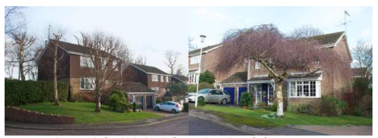
Very attractive houses can be found at both ends of PWC – photo taken 02/02/14

Although within a fairly easy walk of the High Street, this small development is on the rural edge of the village and the border of Haywards Heath and Lindfield. It deserves to be accorded the additional protection of an Area of Townscape Character so that visitors and residents approaching Lindfield from the North can continue to appreciate the rural village setting.