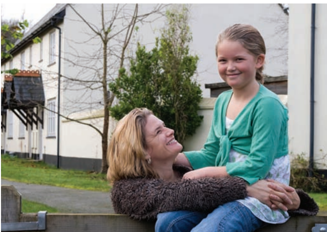
Two of 10 homes built in two phases at Brook Lane Cottages, Widecombe-in-the-Moor, Devon