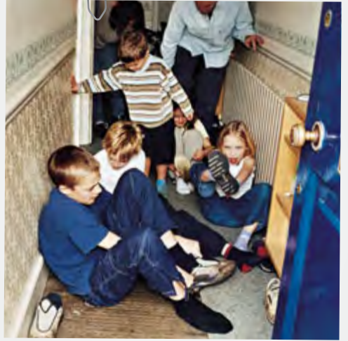
Overcrowding can be a major problem for families with children.