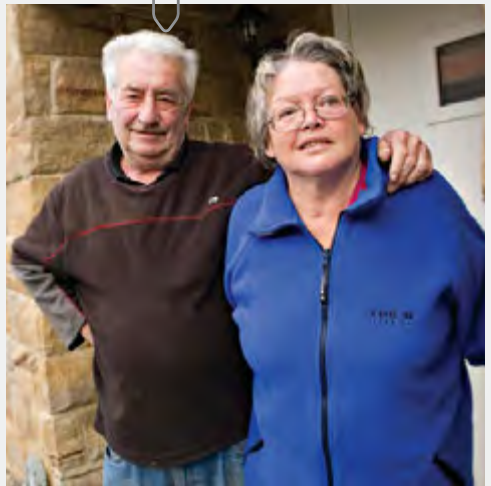
A small affordable housing development in Chop Gate provided houses for elderly couples and young families.

All these local people are delighted that Stewart Court has allowed them to continue living in and contributing to their village.