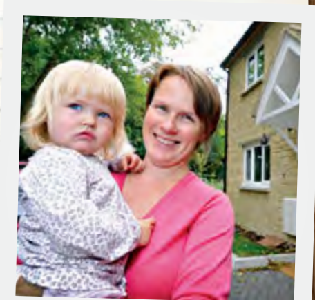
Residents of Cottsway Housing's development of five homes at Akeman Rise, Ramsden, Oxfordshire.