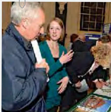
Hungerford people shaped the new development.

As a result of the support engendered by the extensive community consultation, the Town Council have its full support to a planning application for 16 homes on the site. This was approved by the local council in March 2010, and work started on site in May that year.