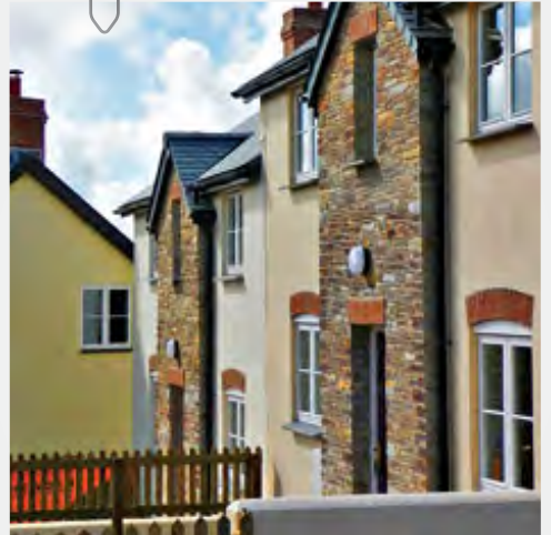
New homes built with local materials at Percy's Meadow in Blisland, Cornwall.